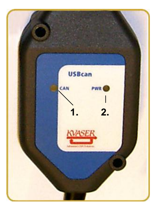
Figure 4. USBcan Rugged. LED configuration.