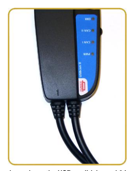
Figure 2. The channels on the USBcan II (channel 2 is not marked).