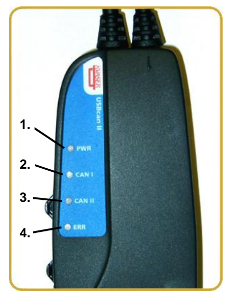
Figure 3. USBcan II LED configuration.

The LED's have somewhat different meaning on the different hardware. See Table 2 for USBcan II or Table 3 for USBcan Rugged.