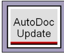
Figure 2: motohawk_autodoc block